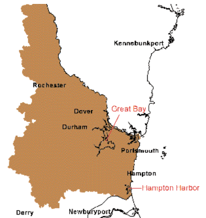
New Hampshire Estuaries watershed.

For more information regarding the New Hampshire Estuaries Project, call (603) 433-7187, write us at 152 Court Street, Portsmouth, NH 03801-4485 or email us at chrisnash@rscs.net .